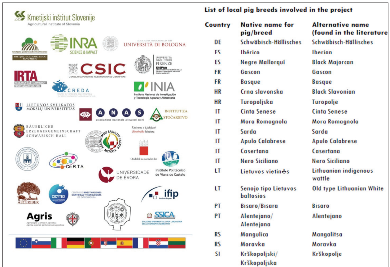
Figure 1. Basic data about the project, partners and local pig breeds involved