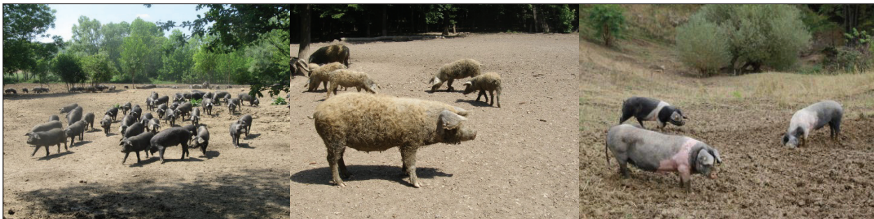
Figure 1. Croatian local pig breeds Black Slavonian (left), Turopolje (middle) and Slovenian local pig breed Krškopolje breed (right) will be studied in H2020 project TREASURE

In this project the breeds from Croatia and Slovenia are also included, namely the Black Slavonian (Crna slavonska svinja), Turopolje (Turopoljska svinja) from Croatia and Krškopolje (Krškopoljski prašič) from Slovenia. In the past years due to many efforts these breeds have been preserved from extinction. However, they remain untapped, with their potential little explored and exploited. This denotes a special interest of the stakeholders to benefit as much as possible from the activities and network of the TREASURE project. Following is the description of the project activities scheduled for these breeds.