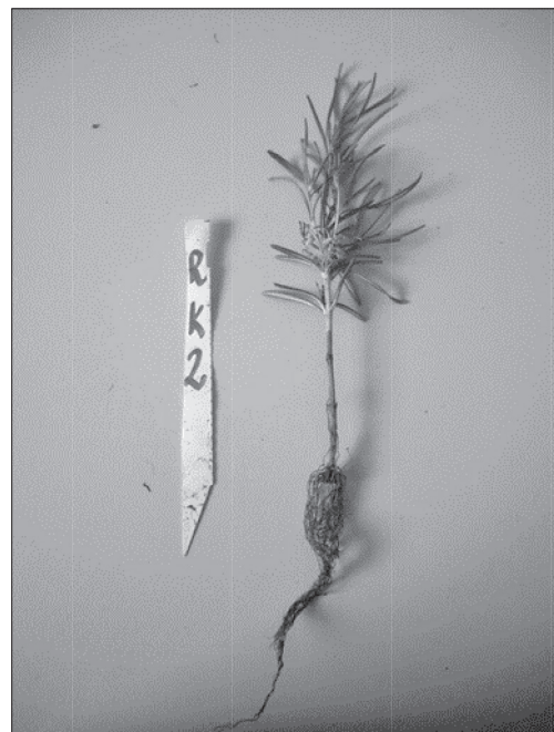
Figure 3. Development of treated with hormone (RA2) and untreated (RK2) cuttings of R. officinalis

Slika 3. Razvoj tretiranih renica (RA2) R. officinalis s hormonom i netretiranih (RK2)