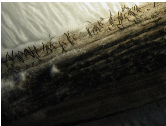
Photo 2. Perithecia on stem X. italicum (orig.) Slika 2. Periteciji na stabljici X. italicum (orig.)