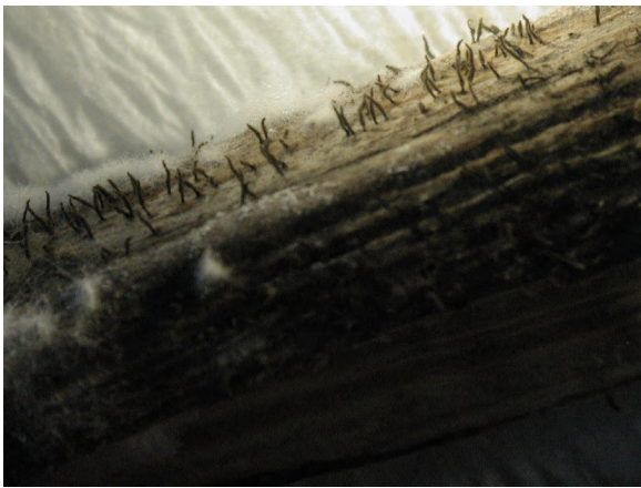
Photo 2. Perithecia on stem X. italicum (orig.) Slika 2. Periteciji na stabljici X. italicum (orig.)