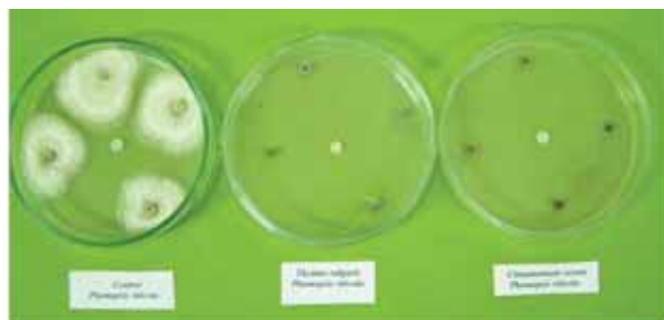
Photo 1. Influence of common thyme and cinnamon leaf essential oils on mycelium growth of P. viticola

On the other hand, only aniseed oil (anethole 83.50%) had statistically significant negative impact on mycelium growth of T. cucumeris and peppermint (menthol 41.06%) and common thyme oils on mycelium growth of F. graminearum .