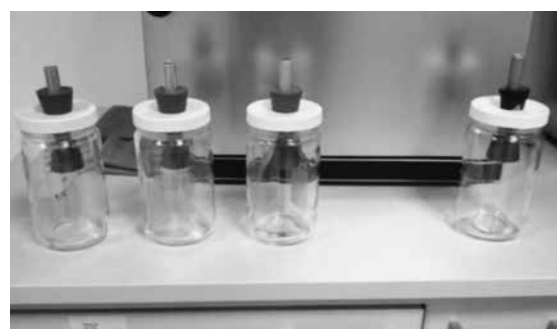
Figure 9 Plugs in glass jars with inhibitor

After the exposure, plugs are removed from glass jars and 10 ml of a 3 % glycerine solution is added to jars. Jars are closed and left to rest for another two hours. The process of extracting glycerine from jars is shown in Figure 10.