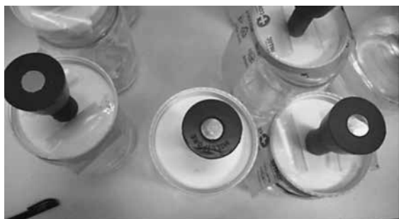
Figure 12 Visual inspection after testing

After resting for two hours in the oven, glass jars are opened and plugs are wiped with a cloth and methanol to remove the condensate. Samples are then left to dry completely at room temperature. Appearance of plugs after testing is shown in Figure 12.