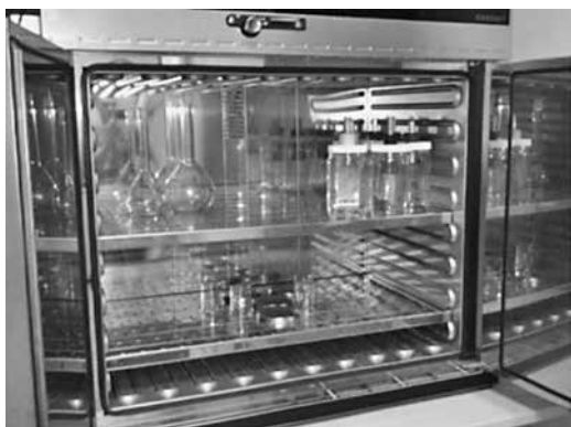
Figure 11 Test samples in oven