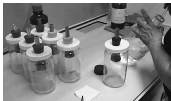
Figure 10 Extraction of glycerine solution from a jar

After the exposure, plugs are removed from glass jars and 10 ml of a 3 % glycerine solution is added to jars. Jars are closed and left to rest for another two hours. The process of extracting glycerine from jars is shown in Figure 10.