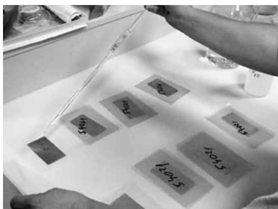
Figure 3 Applying drops of deionized water to the test samples

Testing is performed on four samples. Three samples are protected by foil and one sample is taken as a control without foil. After the test, samples are compared to assess the corrosion inhibitor action. After rough cleaning, test samples are placed in a container with methanol for five minutes, so that methanol removes the remaining impurities and grease from the samples, Figure 2.