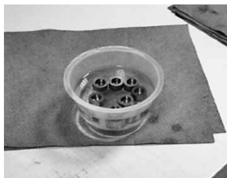
Figure 8 Plugs in methanol