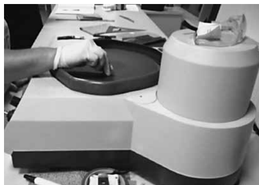
Figure 7 Machine polishing of plugs

After cleaning of plugs, inhibitory tapes are labelled with numbers. Plugs are placed in rubber holders with polished side down, facing the inner side of the jar, so that the polished surface is exposed to vapour inhibitor. Inhibiting foil is stuck onto the lid and put in the jar in a hanging position to allow it to release corrosion inhibitors, as shown in Figure 9. The process of corrosion inhibition lasts for 20 \pm 1 hours.