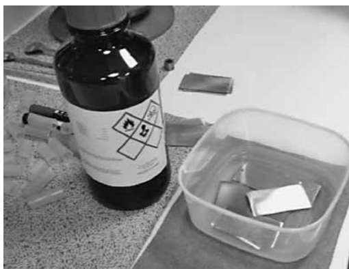
Figure 2 Test samples in methanol

Testing is performed on four samples. Three samples are protected by foil and one sample is taken as a control without foil. After the test, samples are compared to assess the corrosion inhibitor action. After rough cleaning, test samples are placed in a container with methanol for five minutes, so that methanol removes the remaining impurities and grease from the samples, Figure 2.