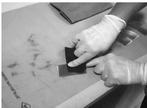
Figure 1 Cleaning of test samples