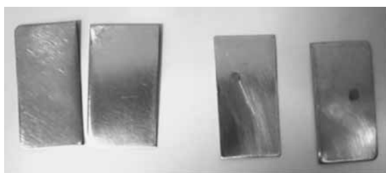
Figure 6 Surface of test samples after the experiment

Test samples with corrosion inhibitors have not developed corrosion on their surface, while samples without protection exhibited clear traces of corrosion.