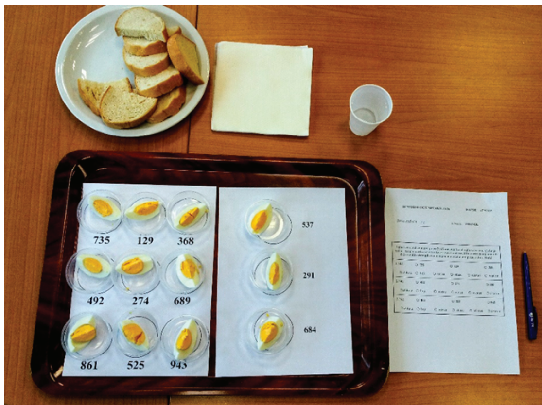
Figure 1. The egg samples prepared for sensory analysis (Kos, 2019)

consumption. Prior to tasting, the eggs were cut longitudinally into quarters, and one quarter represented a tasting sample served to the tasters. Within the triangle test, the three sets, consisting of the three egg samples marked with a three-digit code, were given to each taster. Within each set, two egg samples were the same, and one was different (Figure 1).