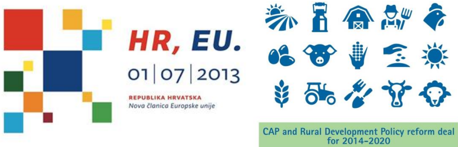
Fig. 1. Common Agricultural Policy Зajедничка пољопривредна политика

The Republic of Croatia became a full member of the European Union on 1 July 2013. Full membership means that it should apply the Common Agricultural Policy (CAP), the same as all other Member States.