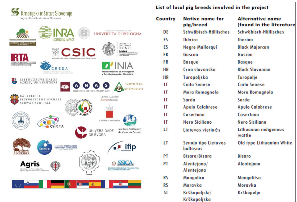
Figure 1. Basic data about the project, partners and local pig breeds involved