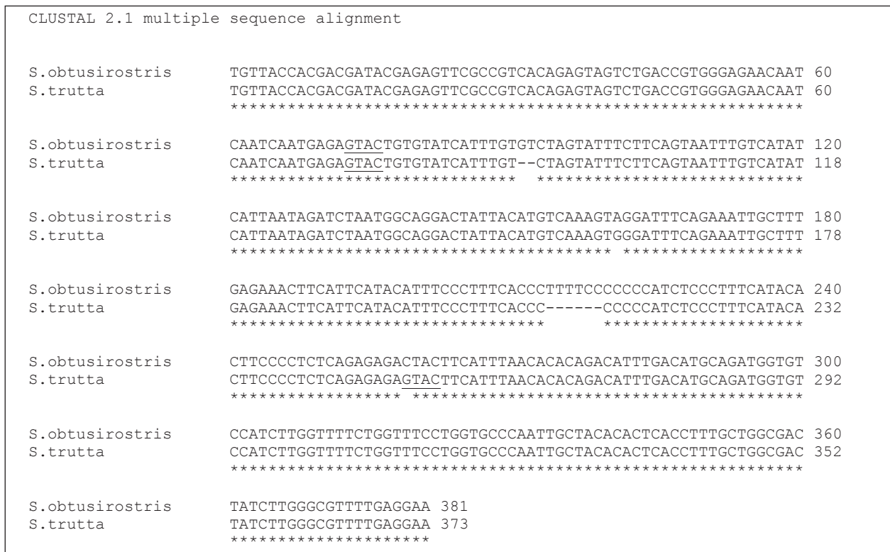
Figure 1. Clustal 2.1 alignment of the PCR-amplified part of the (LDH) C1* gene in S. trutta and S. obtusirostris with underlined RsaI restriction enzyme recognition sites

PCR products were cleaved by RsaI restriction endonuclease, with a recognition site gt/ac. The amplified part of the (LDH) C1* gene in S. trutta contained two RsaI recognition sites, leading to three bands after restriction in the length of 74, 135 and 166 bp (genotype NP). On the other hand, PCR product of S. obtusirostris possessed only one restriction site because of the disruption of the second recognition site due to a G/C transformation (MP genotype), leading to only two bands in the length of 74 and 300 bp after restriction, respectively (Figure 1). Products of restriction reactions were checked on the 2% agarose gel.