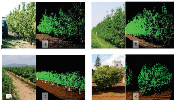
Figure 7 Pictures of different crop training systems and their corresponding 3D images obtained by the LIDAR system: pear trees (a), apple trees (b), vineyards (c) and citrus trees (d) [49]

This type of sensor can be used under all conditions of a strong magnetic field, high temperature, electric noise and chemical corrosion, and are much more flexible and reliable than ultrasonic sensors. The bad sides are: the complexity of signal production and its processing, a demand for the optical visibility between the receiver and the transmitter, and the sensitivity to mechanical vibration.