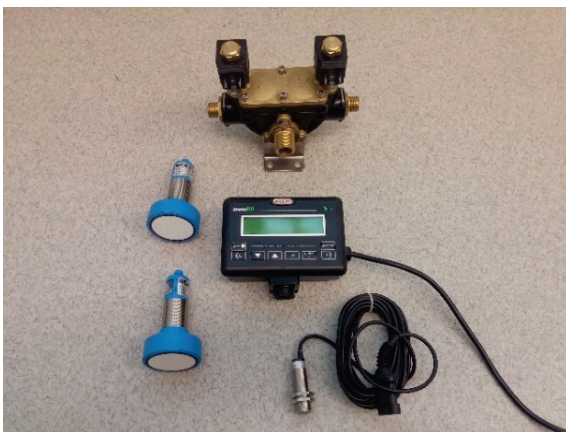
Figure 2 Ultrasonic Sensor System

The most common type of ultrasonic sensor construction is in the form of a prism or a cylinder. The transceiver head may be separated from the electronic part, enabling it to be installed at inaccessible locations. The use of ultrasonic sensors in agriculture is as an idea taken from the industry, where they are used to measure different distances and determine the presence of objects [21]. Fig. 2 shows the complete system of ultrasonic sensors with electromagnetic valves and the control unit used on the sprayers.