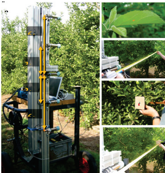
Figure 4 Test platform with ultrasonic sensors [42]

The usage of ultrasonic sensors in agricultural production has been tested on several factors. One of the key factors is the distance of the sensor from the treetop and the speed of the sprayer's movement. If the distance of the sensor is smaller, the echo ultrasound wave (echo signal) will be of greater intensity, and thus the accuracy of the measurement, while by increasing the distance, the echo signal is weakened and errors occur when reading the results [14]. If the treetop is at a small distance between the treetop and the sensor, the possibility of interference between the two sensors increases and the reading accuracy decreases [43]. According to the above mentioned authors, the average reading error in laboratory conditions is \pm 0.53 cm, while in field conditions, the detection error is \pm 5.11 cm, taken on the average. By analyzing the obtained results, it can be concluded that it is very important to determine the correct distance between the ultrasonic sensors with respect to the width of the angular ultrasound waves and the distance from the detected treetop. In Fig. 4, a test platform with differently positioned ultrasonic sensors for determining a reasonable distance between sensors and treetops, with the aim of preventing the interference, is shown.