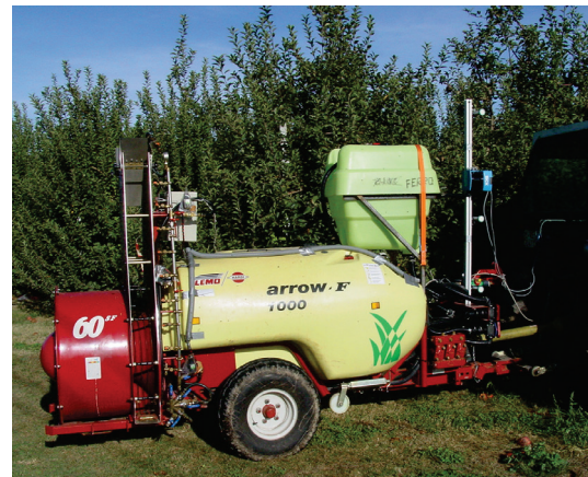
Figure 3 Ultrasonic and LIDAR sensors equipped air assistance sprayer [40]

Ježić, V. et al. [31] develop an automatic spraying system, where computer-controlled spraying is achieved by the use of ultrasonic sensors and an RGB camera. The automatic system is tested at a speed of 3 kmh -1 where, with respect to the control sensor-free spraying, the savings of 20.2% per each nozzle are achieved. The same authors state that the deposit, distribution and surface coverage remained unaltered by the use of sensory spraying.