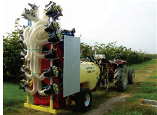
Figure 5 CIS air assistance sprayer [25]

Li, H. et al. [48] explore the model for treetop density determination that is examined in laboratory conditions, comparing the control model of leaves put in four layers, chosen as optimal, and models with a different number of leaves' layers. The obtained results show a reading error of between 17.68 and 29.92%, in comparison with the control model. According to the above mentioned authors, the ultrasound system tested is sufficiently precise for the variable rate technology usage (VRT).