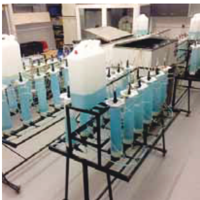
Figure 1. Experimental setup for anaerobic batch co-digestion of camelina and cow manure.

Biogas volume and composition were measured every day. The total volume of biogas produced in 1 day was obtained by summing the volumes of accumulated biogas in all bottles which were filled with gas, and the composition of biogas (CH 4 , N 2 , and CO 2 ) was analyzed according to a modified method HRN ISO 6974-4:2000 using a GC (Varian 3900) equipped with capillary column CP-PoraPLOT Q fused silica PLOT 25 mm × 0.53 mm, df = 20 μm.