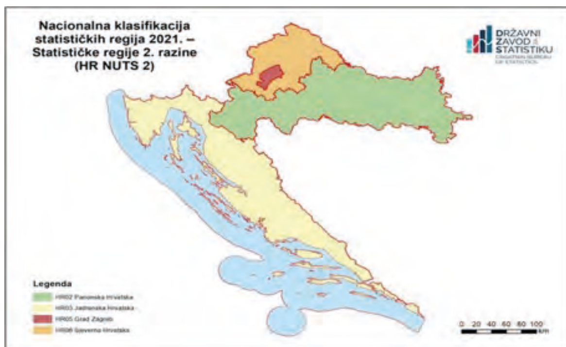
Figure 1. Level 2 Statistical Regions (HR NUTS 2)

IBM SPSS, Statistics V22.0 software package was used for statistical data processing and analysis. The variables and their descriptive statistics are presented in Table 1. Unlike the previous cluster analysis on these data (Petrač et al., 2023) when the quantitative variables NOC, ADOM, NOPC and AUC were used, here the qualitative variable Region (REG) was added. To define the mentioned variable, the national classification of statistical regions from 2021 was used - Level 2 Statistical Regions (HR NUTS 2), in which the Republic of Croatia is divided into 4 regions (Croatian Bureau of Statistics, 2021): Pannonian Croatia, Adriatic Croatia, City of Zagreb and Northern Croatia (Figure 1).