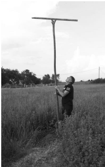
Figure 1. Installed T-standpoint in the observed lucerne crop

The research comprised an installation of two T-standpoints at approximately 1 ha of lucerne crop in the village of Ernestinovo in Croatia and monitoring of predatory birds descending to installations, waiting for the prey and landing to the ground (assumed as an attack) during 10 months of observation (from June 2018 to November 2018 and from March 2019 to June 2019). T-standpoints were about 3 m high (Figure 1).