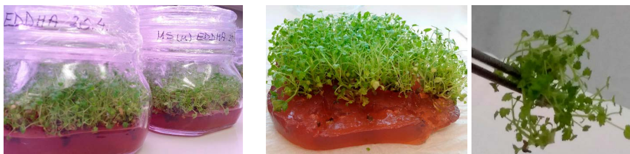
b. MSm Semi-solid / Polučvrsti - 30 days