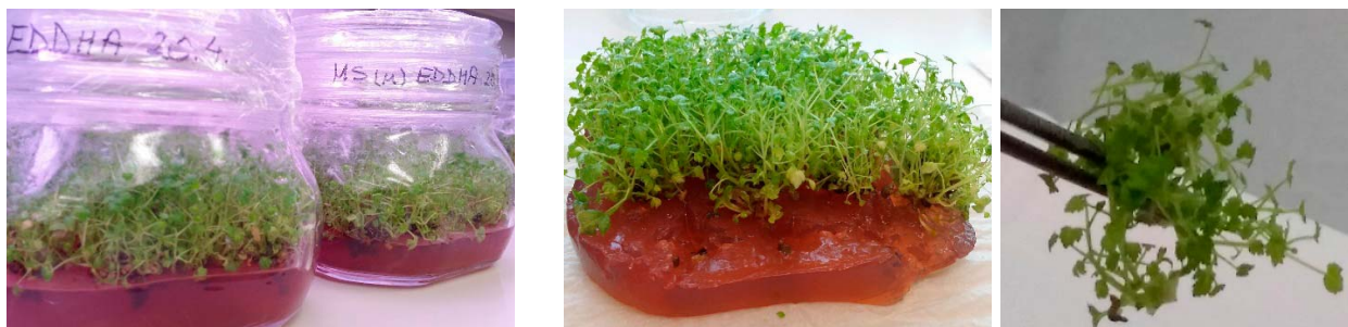
b. MSm Semi-solid / Polučvrsti - 30 days