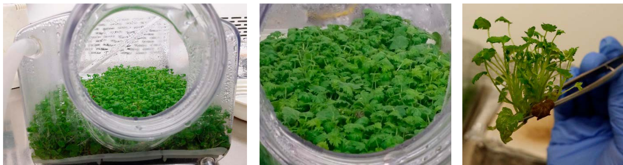
a. MSm SETIS™ - 15 days

distribution of nutrients and aeration - gas exchange and moisture control) favored a higher macro- and microelements adoption efficiency. Although Zawadzka and Orlikowska (2004 and 2009) reported a positive effect of the FeEDDHA chelate (MSm medium) exerted on the biomass production, this was not confirmed by our research. The visual plant assessment results at the cycle end (a more pronounced vigor and an intense chlorophyll color - leaf, Fig. 2), suggests, however, that a future use of this form of iron in temporary immersion systems is justified.