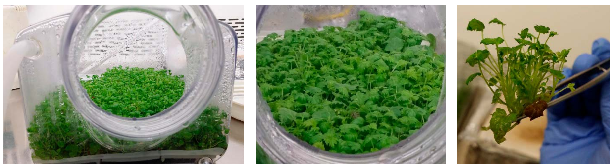
a. MSm SETIS™ - 15 days

distribution of nutrients and aeration - gas exchange and moisture control) favored a higher macro- and microelements adoption efficiency. Although Zawadzka and Orlikowska (2004 and 2009) reported a positive effect of the FeEDDHA chelate (MSm medium) exerted on the biomass production, this was not confirmed by our research. The visual plant assessment results at the cycle end (a more pronounced vigor and an intense chlorophyll color - leaf, Fig. 2), suggests, however, that a future use of this form of iron in temporary immersion systems is justified.