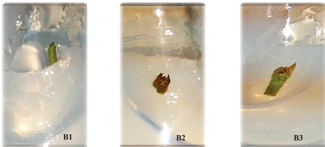
Figure 1. Type of explants (B): B1 - without primordial leaves, B2 - with primordial leaves, B3 - nodal explants

The collected material was washed with distilled water and stored in the refrigerator for 24 hours at 4°C. The study used two treatments of surface sterilization on three types of explants. Types of explants include: buds without primordial leaves (B1), buds with primordial leaves (B2) and (B3) nodal 1.5 cm long un lignified segment with one axillary bud (Figure 1). Meristem dissection of primordial leaves (B1) was conducted under the stereomicroscope (Nikon SMZ1000).