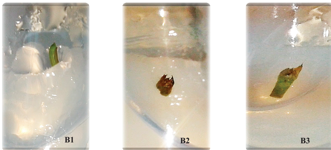
Figure 1. Type of explants (B): B1 - without primordial leaves, B2 - with primordial leaves, B3 - nodal explants

The collected material was washed with distilled water and stored in the refrigerator for 24 hours at 4°C. The study used two treatments of surface sterilization on three types of explants. Types of explants include: buds without primordial leaves (B1), buds with primordial leaves (B2) and (B3) nodal 1.5 cm long un lignified segment with one axillary bud (Figure 1). Meristem dissection of primordial leaves (B1) was conducted under the stereomicroscope (Nikon SMZ1000).