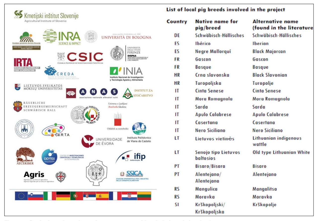
Figure 1. Basic data about the project, partners and local pig breeds involved