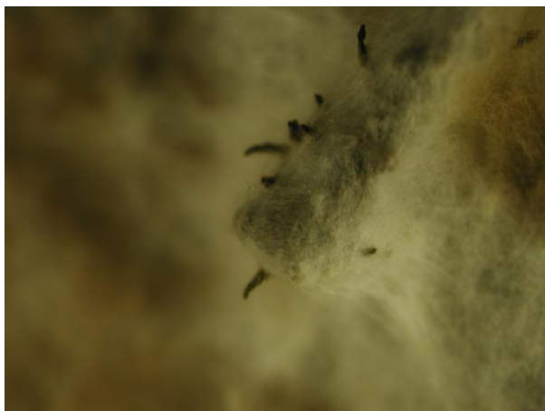
Photo 1. Perithecia of D. helianthi on autoclaved A. theophrasti stem Slika 1. Periteciji D. helianthi na autoklaviranim stabljikama A. theophrasti

formation was not determined, probably because the experiment period of 12 days was too short for development of teleomorphic structure.