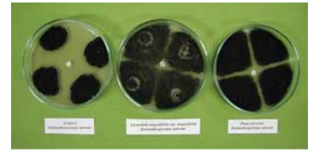
Photo 2. Influence of lavander and scots pine essential oils on mycelium growth of H. sativum

Slika 1. Utjecaj eteričnog ulja timijana i cimeta na porast micelija P. viticola