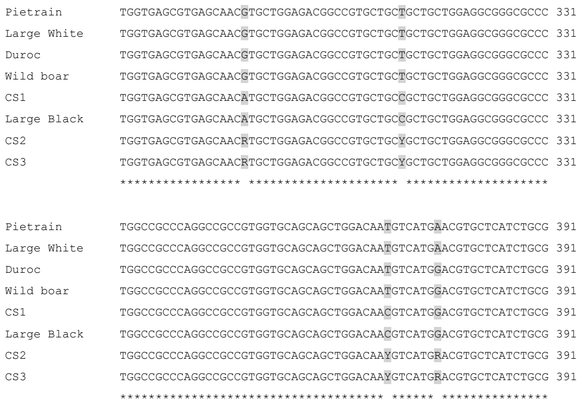
Figure 3. Clustal 2.1 MC1R sequences alignment of three different CS gene pools (CS1, CS2 and CS3) with MC1R sequences of commercial breeds and Wild boar

MC1R genotyping showed that 27 out of 70 analyzed animals were heterozygous, i.e. possessed only one “black” allele. When compared the MC1R genotyping results with results based on MS analysis, it was observed that MC1R homozygous animals correspond to the major CS gene pool (CS1), while animals from the other two gene pools (CS2 and CS3) were MC1R heterozygous. Only one animal from the CS2 gene pool was MC1R homozygous.