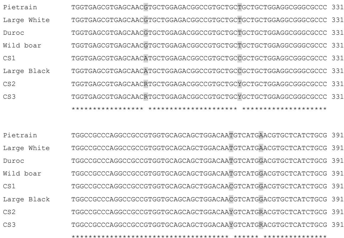
Figure 3. Clustal 2.1 MC1R sequences alignment of three different CS gene pools (CS1, CS2 and CS3) with MC1R sequences of commercial breeds and Wild boar

MC1R genotyping showed that 27 out of 70 analyzed animals were heterozygous, i.e. possessed only one “black” allele. When compared the MC1R genotyping results with results based on MS analysis, it was observed that MC1R homozygous animals correspond to the major CS gene pool (CS1), while animals from the other two gene pools (CS2 and CS3) were MC1R heterozygous. Only one animal from the CS2 gene pool was MC1R homozygous.