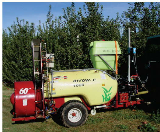
Figure 3 Ultrasonic and LIDAR sensors equipped air assistance sprayer [40]

Ježić, V. et al. [31] develop an automatic spraying system, where computer-controlled spraying is achieved by the use of ultrasonic sensors and an RGB camera. The automatic system is tested at a speed of 3 kmh -1 where, with respect to the control sensor-free spraying, the savings of 20.2% per each nozzle are achieved. The same authors state that the deposit, distribution and surface coverage remained unaltered by the use of sensory spraying.