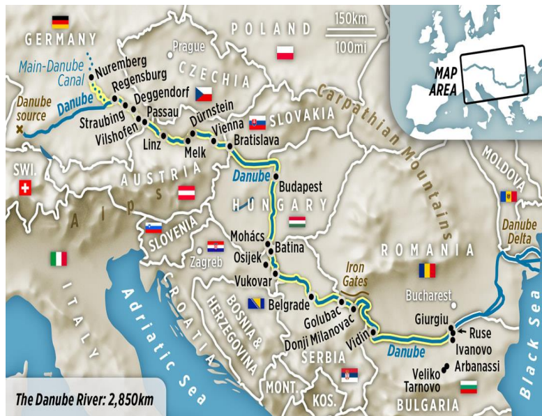
Figure 3. VII. Pan-European corridor - Danube waterway ( https://www.authenticvoyages.com/uploads/1/1/7/8/117821287/danube-river-cruise-map-2021_orig.jpg )