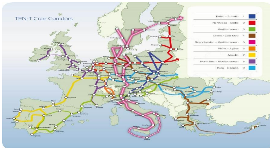
Figure 2. Trans-European transport network ( https://www.portnews.it/wp-content/uploads/2018/05/BBT-TEN-T-Korridore-Nov_2017_EN.jpg )

The trans-European transport network consists of nine corridors: Baltic-Adriatic, North Sea-Baltic, Mediterranean, Middle East-East Mediterranean, Scandinavian-Mediterranean, Rhine-Alpine, Atlantic, North Sea-Mediterranean, Rhine-Danube. Each of them must include three types of transport infrastructure, pass through three member states and two border crossings. The Republic of Croatia is located on two corridors of the transport network, the Mediterranean Corridor and the Rhine-Danube Corridor. The Mediterranean Corridor connects the south of the Iberian Peninsula, crosses the Spanish and French Mediterranean coasts, passes through the Alps in the north of Italy, then enters Slovenia and continues towards the Hungarian-Ukrainian border. ( https://promet-eufondovi.hr/eu-prometni-koridori-i-ten-t/ )